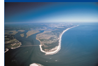
Aerial view of Amelia Island