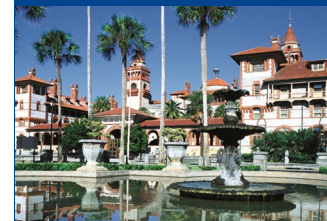
St. Augustine, our Nation's Oldest City