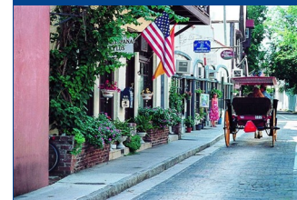
Historic St. George St