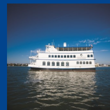
Cruise Around Charleston Harbor