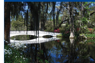
Take in the Picturesque Views of Charleston

Day 5: Enjoy a Continental Breakfast before departing for home... a perfect time to chat with your friends about all the fun things you've done, the great sights you've seen and where your next group trip will take you!