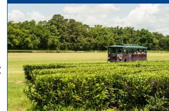
Tour Charleston Tea Gardens