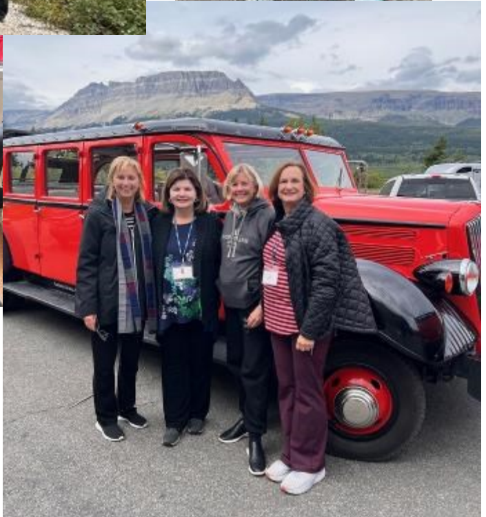
The Trailblazers enjoyed a beautiful trip to Canada in September.