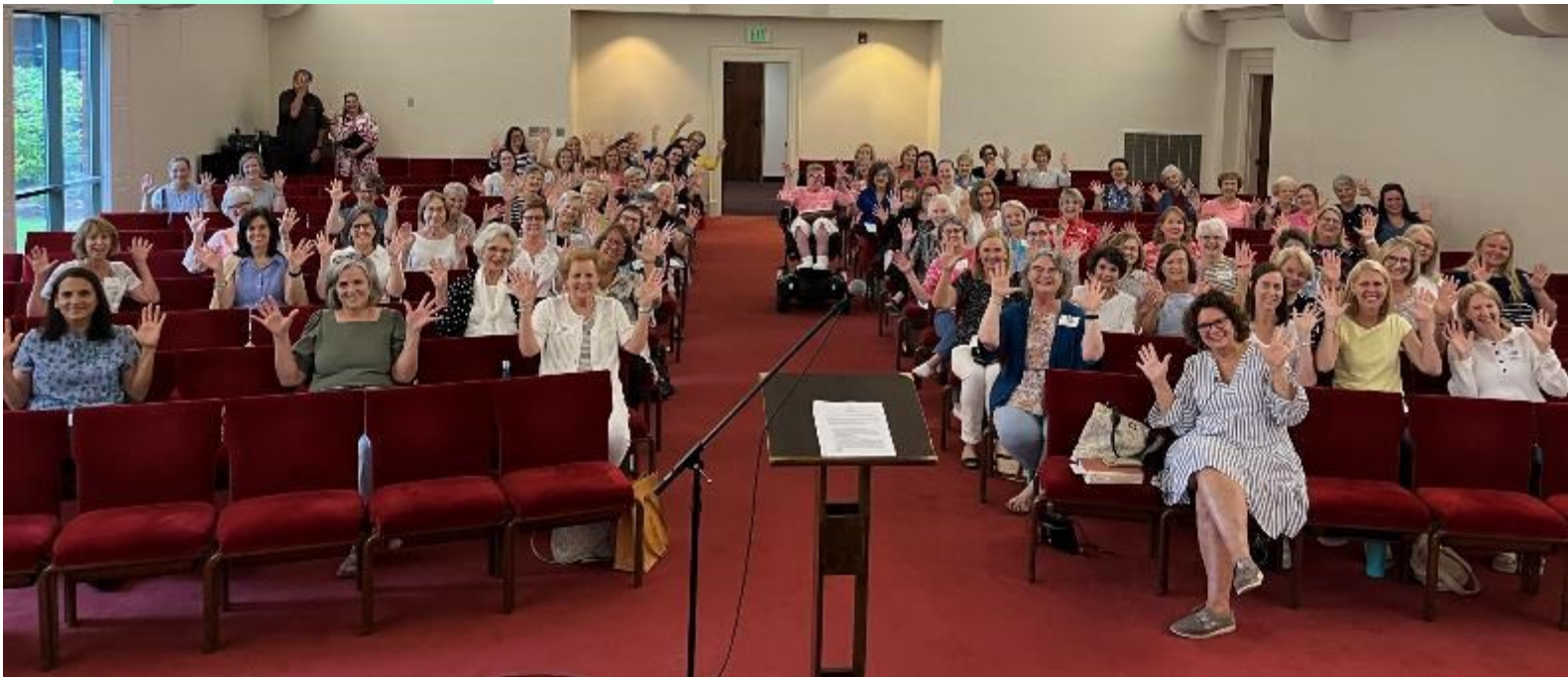
Our Summer women's Bible study series in the Chapel