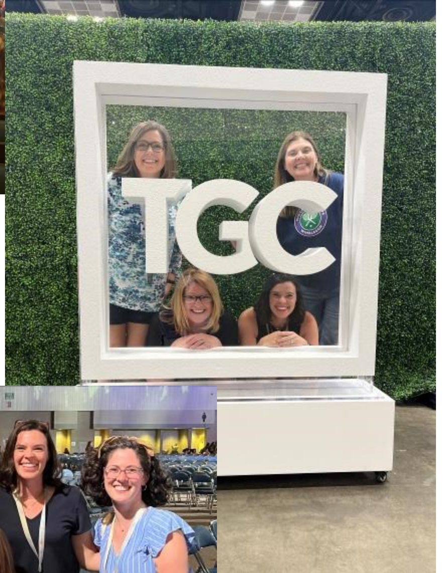
A group of Briarwood women attended The Gospel Coalition Women's conference in Indianapolis.