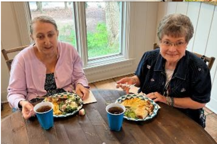
The church Administrative Team, “The A-Team,” enjoyed a Summer Fellowship lunch at the Caroline House