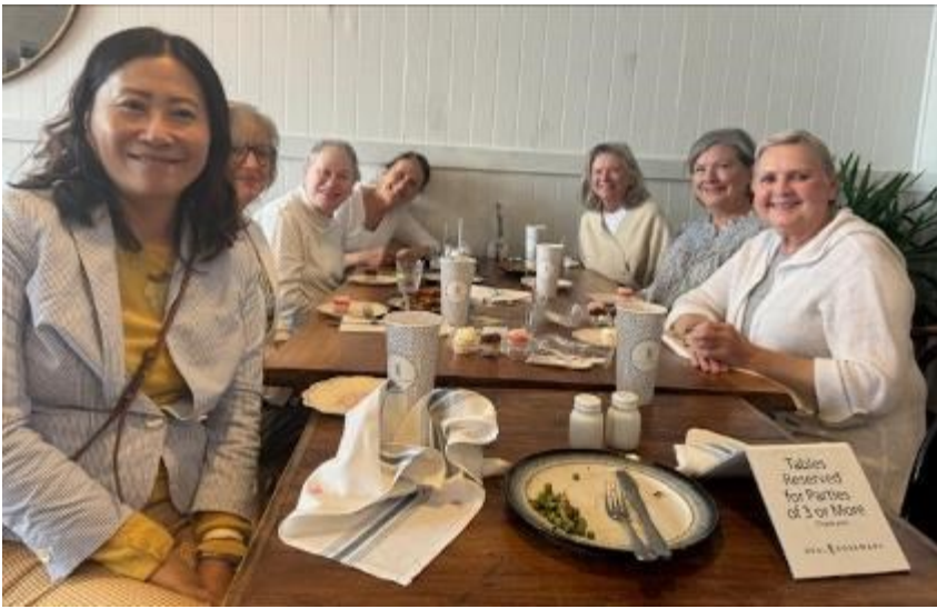
Mountain View women at their monthly birthday gathering.