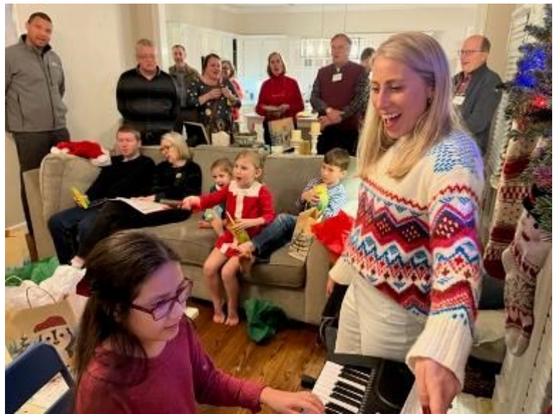
Special Connections Christmas Party