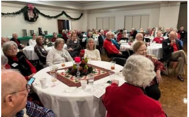
Deeper Life Sunday School Christmas Party