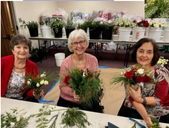
The Flower Guild Christmas Party